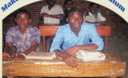
Make Secondary School Curriculum Skills-centred!