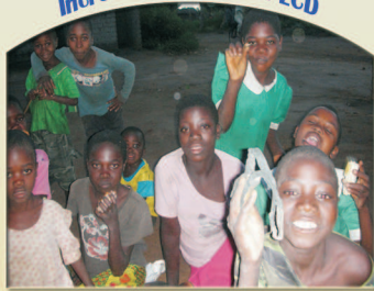
Increase Financing Of ECD